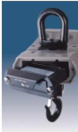
▶ Battery Pack Installation