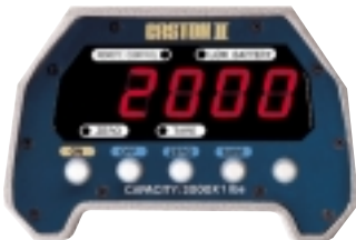
▲ Display & Keyboard