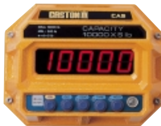
▲ Display & Keyboard