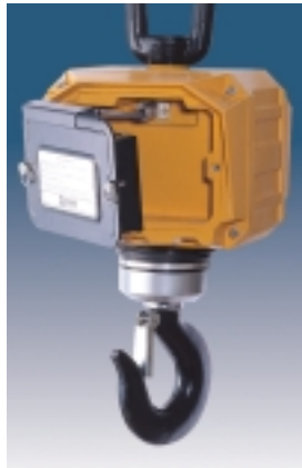
► Battery Pack Installation