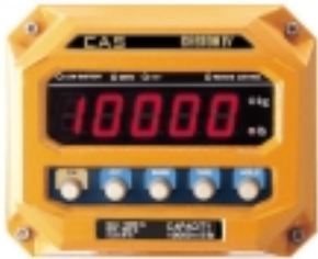
▲ Display & Key board